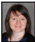
Designated Safeguarding Lead Designated Staff - Looked After Children Lead Professional for EHAs (Early Help Assessments)