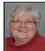
Chair of Governors Nominated Governor for Safeguarding Nominated Governor for Looked After Children