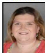
Deputy Designated Safeguarding Lead