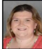
Deputy Designated Safeguarding Lead