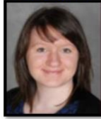
Designated Safeguarding Lead Designated Staff – Looked After Children Lead Professional for EHAs (Early Help Assessments)