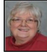
Chair of Governors Nominated Governor for Safeguarding Nominated Governor for Looked After Children