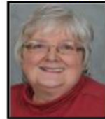
Chair of Governors Nominated Governor for Safeguarding Nominated Governor for Looked After Children