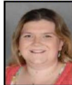
Deputy Designated Safeguarding Lead