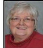
Chair of Governors Nominated Governor for Safeguarding Nominated Governor for Looked After Children