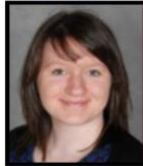
Designated Safeguarding Lead Designated Staff – Looked After Children Lead Professional for EHAs (Early Help Assessments)