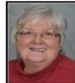
Chair of Governors Nominated Governor for Safeguarding Nominated Governor for Looked After Children