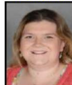
Deputy Designated Safeguarding Lead