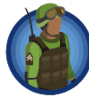
Ministry of Defence