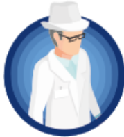
Environmental health service