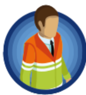
Highways England Traffic Officer service