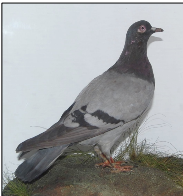
The King of Rome – in Derby museum.

In the West End of Derby lives a working man.